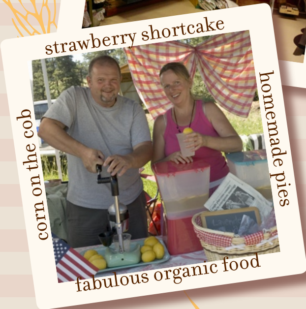
strawberry shortcake corn on the cob homemade pies fabulous organic food