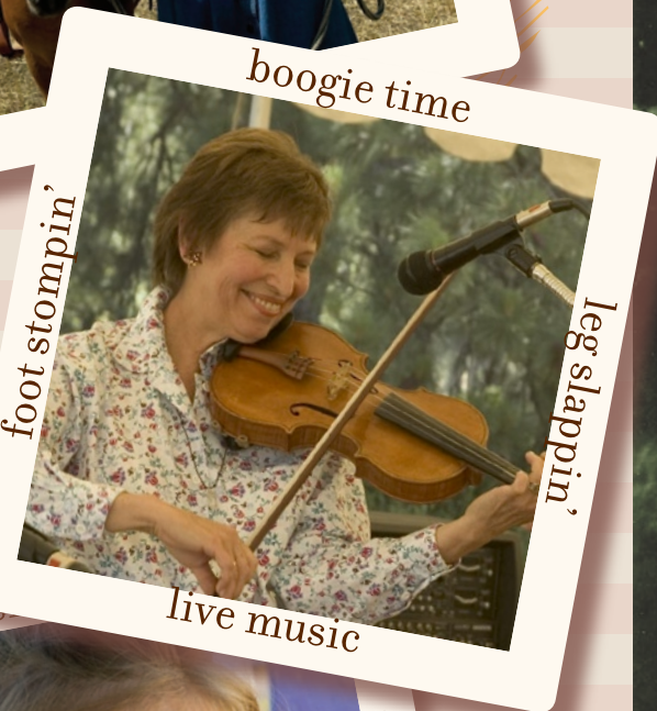
boogie time foot stompin' leg slappin' live music