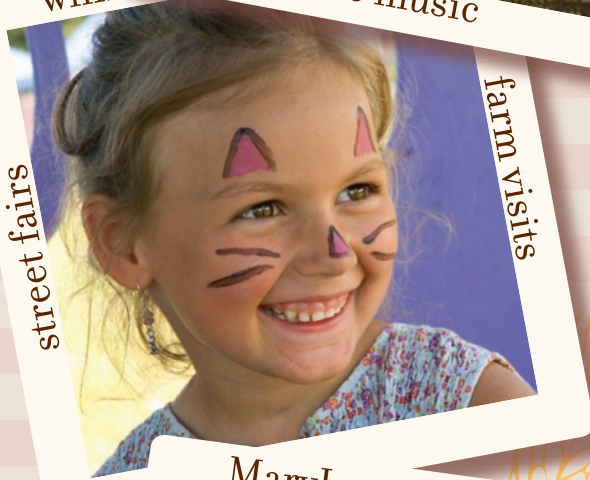
street fairs farm visits