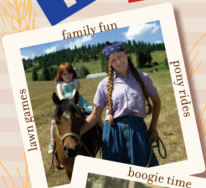
family fun lawn games pony rides