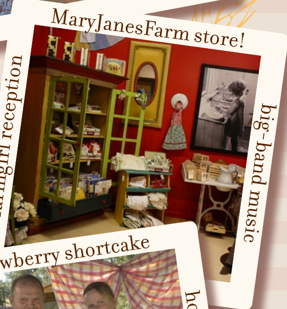
MaryJanesFarm store! farmgirl reception big-band music